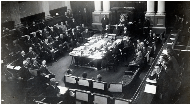
NATIONAL LIBRARY OF AUSTRALIA, PIC/15811

World War I also contributed to an increase in the power of the executive government, demonstrated by the War Precautions Act 1914 and its use to make regulations which, in some cases, restricted the civil liberties of Australians. In addition, the war resulted in a change in the balance of power between the Australian Parliament and the states, with the Australian Parliament assuming more responsibility in areas such as access to loans, and the price of goods and services.